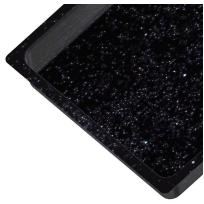
Enameled GN container